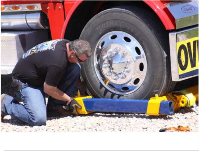
#7) Slide wheel tray onto wheel rod and against tire. Make sure pull pins are both fully engaged