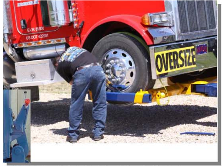
#8) Lift Zacklift fully into J-Lock. Pull strap over wheel and place hook into slot in rear of wheel tray.