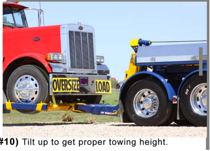
#10) Tilt up to get proper towing height.